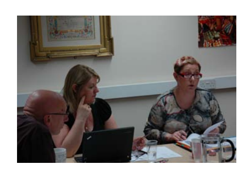
SUV board meeting, Dundee 2010

An overall impression from the Panama meetings is an emerging sense among the Section Chairs that as the locus of specialized expertise they are at the pulse of the profession, and that we can take a leadership role in defining ICA's future. Yet, the advantage will be to those sections able to develop projects in collaboration with other ICA sections or branches. Through such cooperative ventures we will have access to more funding and gain greater credibility.