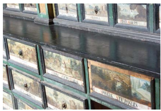
Plasy Monastery, Western Bohemia - 2010 SUV conference excursion