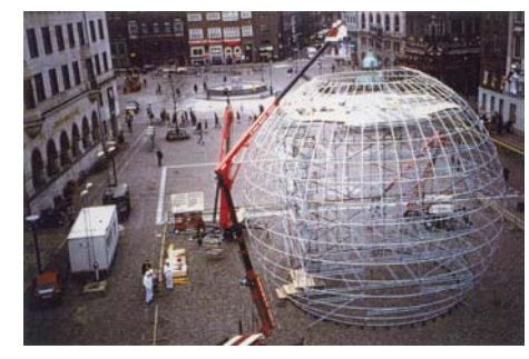
A Symbolic Globe, see sidebar below