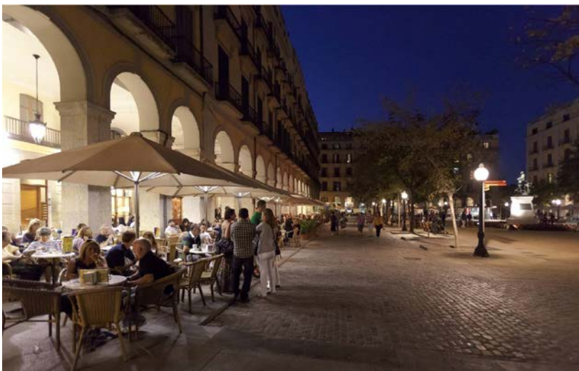
Girona by night, photo: © Jordi S. Carrera

It's very well connected by plane (Girona low cost airport and Barcelona airport) and by high speed train.