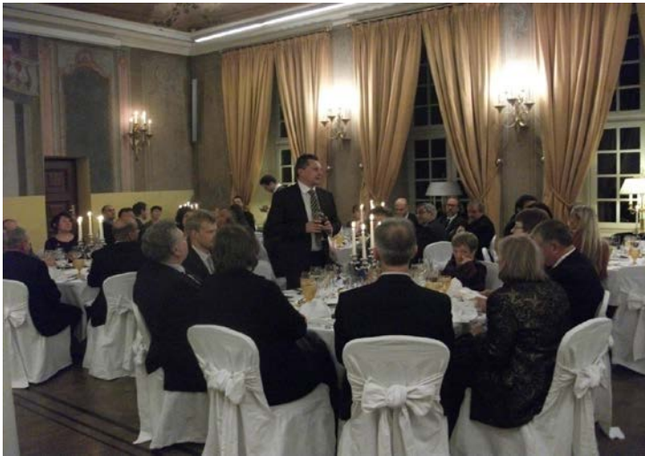
The social event for EBNA participants, organised by the Office of the Chief Archivist of Lithuania, Oct. 2013

embraced preservation of historical archives, new European Union Regulation on personal data protection and archives, some aspects of the practical document management in the European Commission, and the implementation of continuous projects in the field of the EU archives.