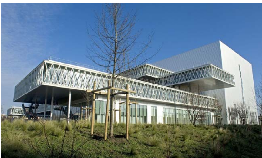
The National Archives at Pierrefitte-sur-Seine

The construction of the new centre of the National Archives at Pierrefitte-sur-Seine is part of large-scale projects started recently and has been commissioned to a prestigious architecture office.