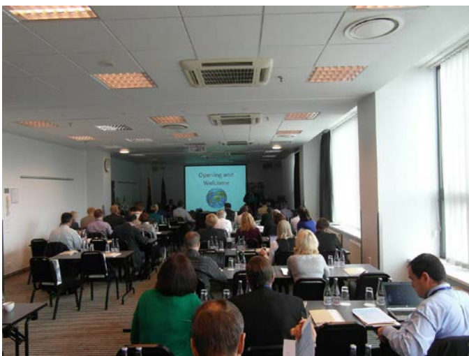
DLM Forum meeting, Vilnius, October 10 – 11, 2013

On October 10 – 11, 2013, the Meeting and Conference of the DLM (Document Life Cycle Management) Forum Members took place in the Conference Centre of the Radisson Blue Hotel Lietuva in Vilnius. The events are usually held every semester in the country presiding to the Council of the European Union. The presentations delivered on the first day of the Meeting addressed the problems arising in the information society and the ways to solve them, the development of the projects under implementation (E-ark and EU Wiki) and the new initiatives.