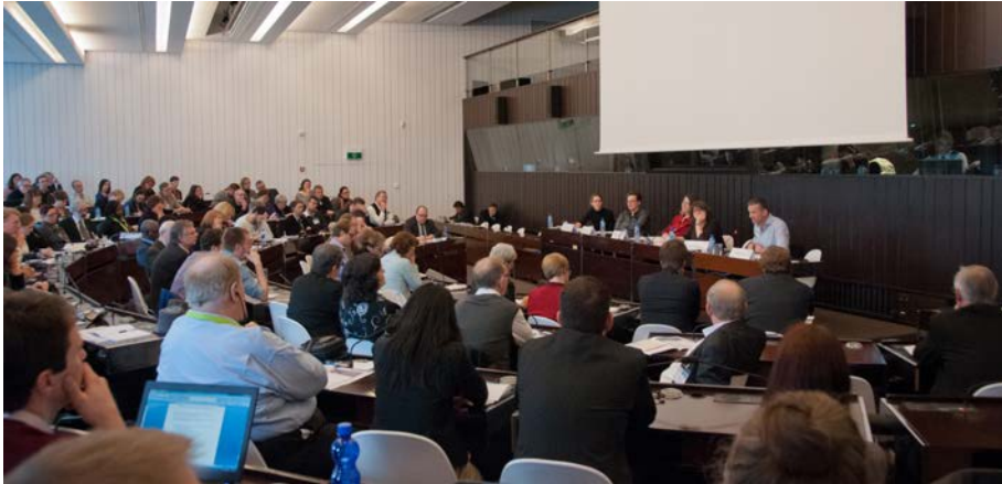
One of the sessions of the Annual Conference, 24 November, Square Congress Centre in Brussels

The acts of the conference won't be published as such, but COMMA, the ICA magazine, will bring a digest of some of the contributions.