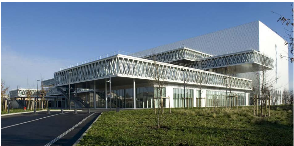
“Photo of the year” the National Archives at Pierrefitte-sur-Seine