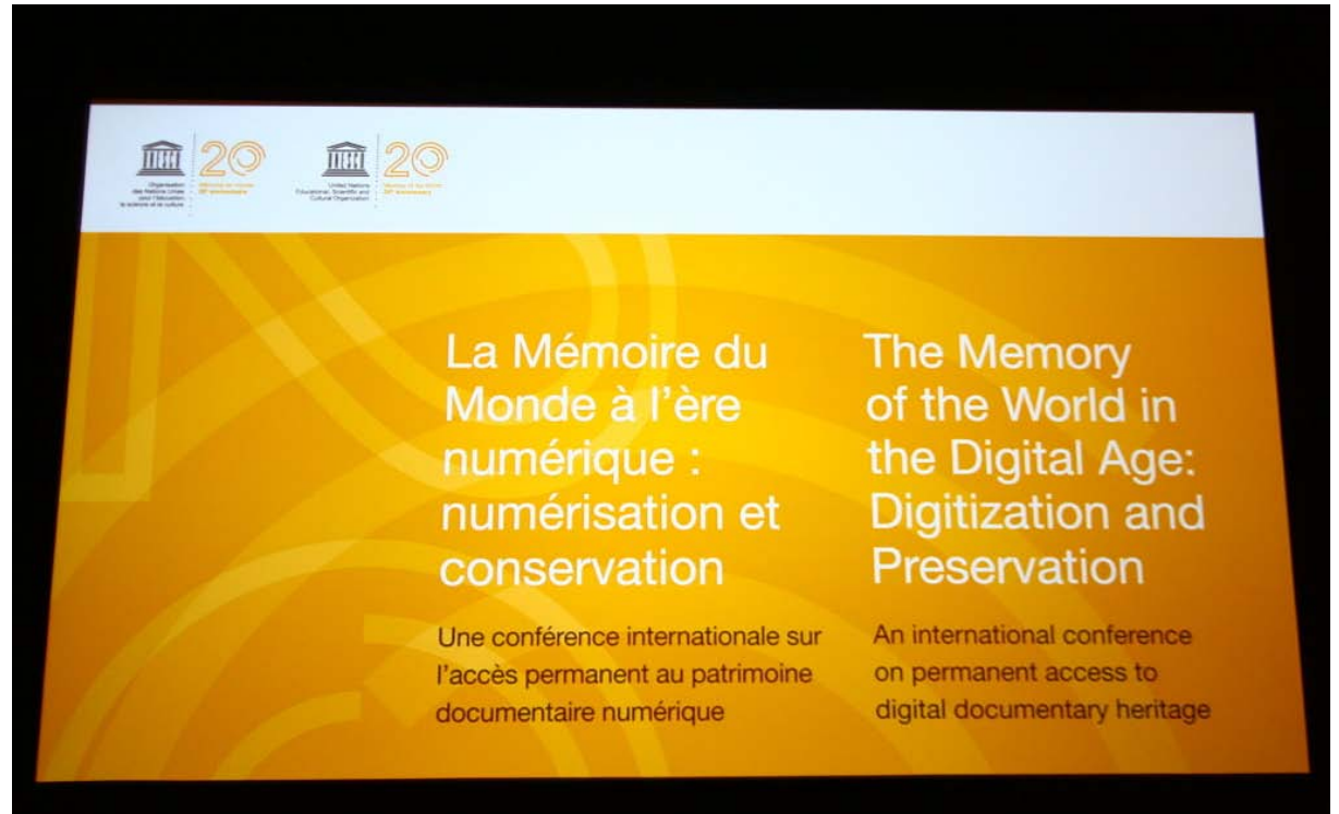
The UNESCO conference poster.