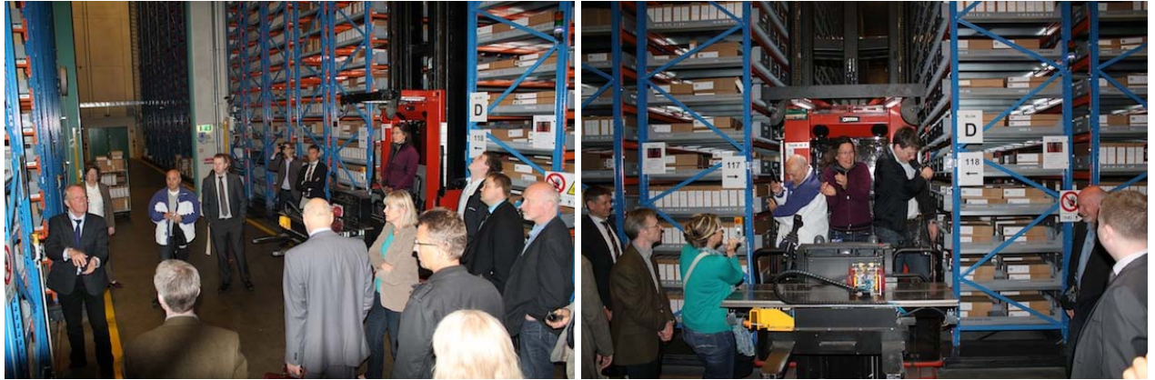
The storage in the Danish National Archives, DLM Forum members meeting, 2012

Head of Section for Digital Archiving, Department of Appraisal and Transfer, Danish National Archives