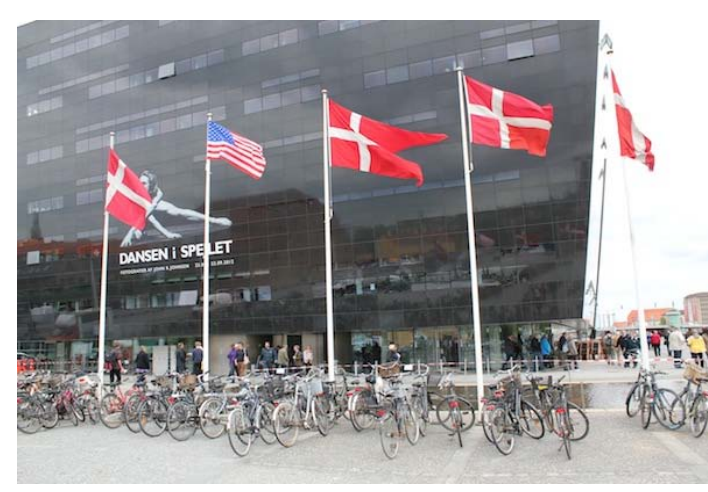
The Danish Royal Library, the DLM