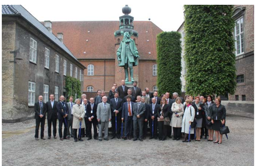
The participants of EBNA meeting in Copenhagen, on May 29, 2012

On 29 May – 1 June 2012, the Danish National Archives gathered the European elite of archivists and conservation experts in Copenhagen for a number of international meetings and conferences: "European Board of National Archivists (EBNA) Conference", "Document Lifecycle Management (DLM) Conference" and "European Branch of the International Council of Archives (EURBICA) Conference", etc. The Danish National Archives hosted these events, which took place at the two addresses of the National Archives in Copenhagen and at the Royal Library. The main theme was: "Common challenges and different strategies in the digital society".