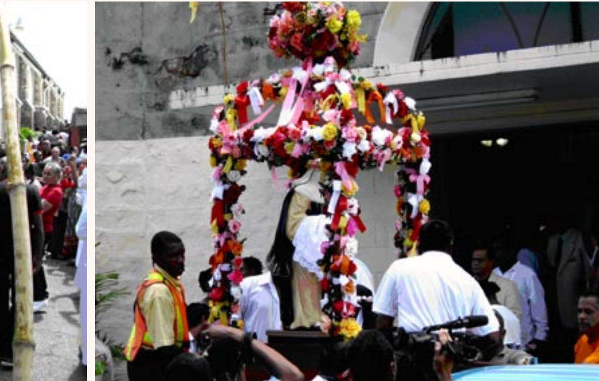
Left: The Santa Rosa Roman Catholic Church, Arima.