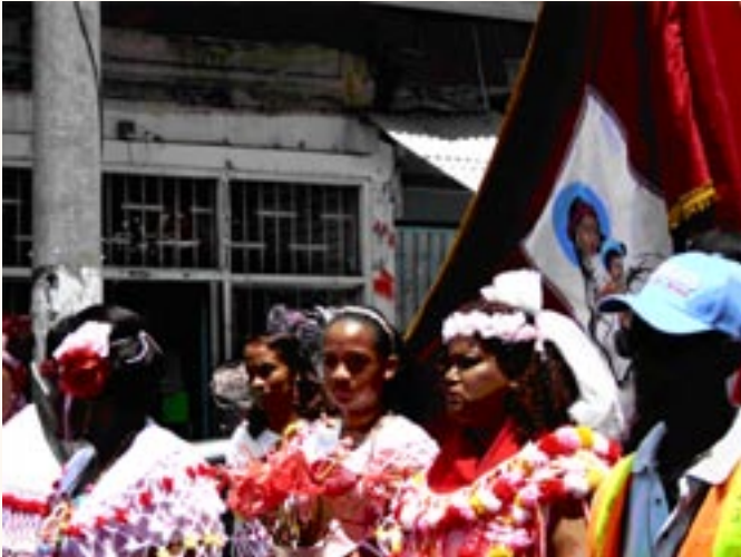
The youth members showing their full support