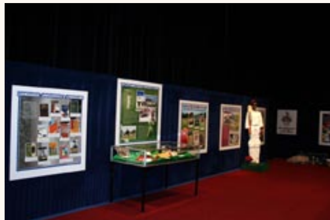
Royal Exhibition to mark the Diamond Jubilee of the Reign of Her Majesty Queen Elizabeth II.