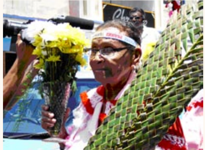
A dedicated member of the Santa Rosa First People Community

contribution to the Borough of Arima. During this Feast they reflect on her life and acknowledge her value to the Santa Rosa Catholic Church of Arima. This even begins with a procession by members of the Carib Community from the Carib Centre to the Church. There is a church service commemorates the Feast, incorporating aspects of indigenous ritualism and Roman Catholic tradition. There is a procession through the Borough of Arima, where a statue of the Saint is adorned with flowers and carried on the back of a truck throughout the streets of Arima, closely followed by the congregation. Soon after the procession, members of the Carib Community along with their supporters venture to the Carib Centre, located at Paul Mitchel Street Arima, for a day of activities that include dancing to Parang music and sharing in their cultural traditions.