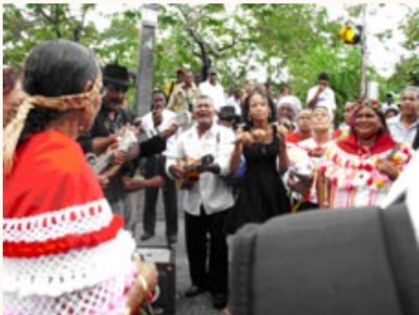
Parangeros entertaining the gathering

Traditional preserving methods of indigenous home construction are also encouraged, where walls are made from tapia (grass, pebbles and mud), and roofs are thatched from palms and coconut branches and floors that are made of compressed earth "washed" over (lipé) with mud. Another element that they seek to revive and preserve is the art of herbal medicine, hunting harvesting of vegetables, fruits and materials used for building, which they refer to as the "arts of the forest". Considering also that Arima is the home of Parang music, they try to maintain close knit ties through the establishment of two (2) Parang bands: Los Niños de Santa Rosa, led by group Secretary Jaqueline Khan until 1999 and Los Niños del Mundo, led by Shaman Cristo Adonis. Their main platform of reclamation and translation of cultural interchanges are all rooted in their historical framework as a Community. Their Feast of Santa Rosa and Heritage week are two examples of how they have retained some aspects that their ancestors have left behind, helping to define what it means to be Amerindian in Trinidad