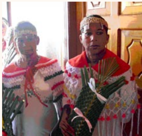
Dressed in their Ceremonial wear at the Funeral